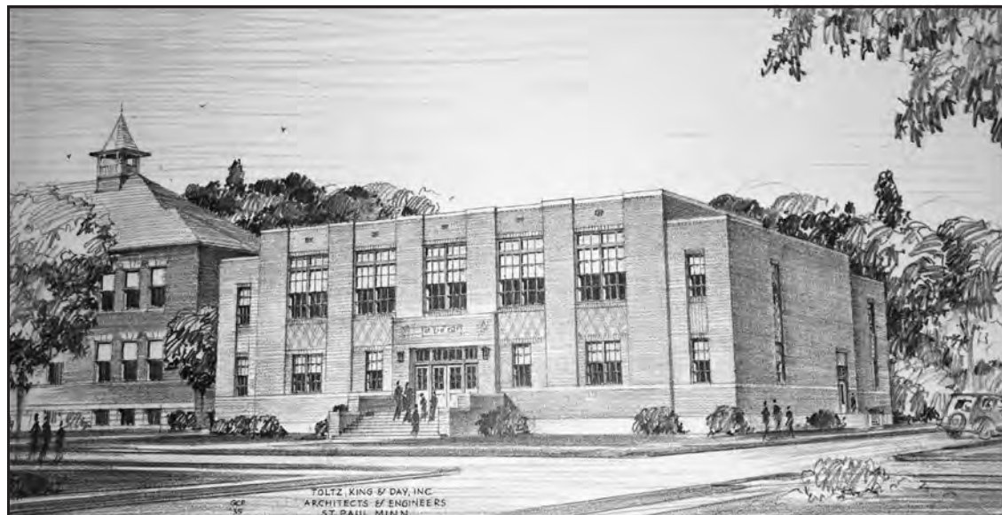
Toltz, King and Day’s architectural drawing for the new gymnasium/auditorium project