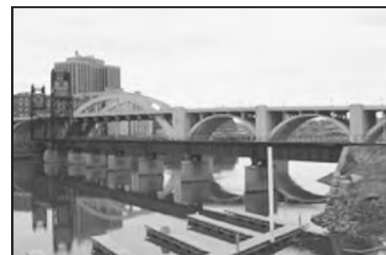
The Robert Street Bridge, St. Paul, designed by Toltz, King, and Day and also on the National Register.