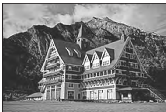
The Prince of Wales Hotel, Waterton Lakes National Park, Alberta, Canada, designed by Toltz, King, and Day and listed on the Canadian Register of Historic Places.