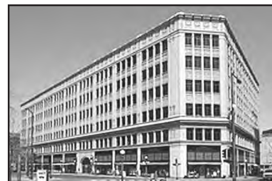
The Hamm Building, St. Paul—another Toltz, King and Day designed building on the National Register