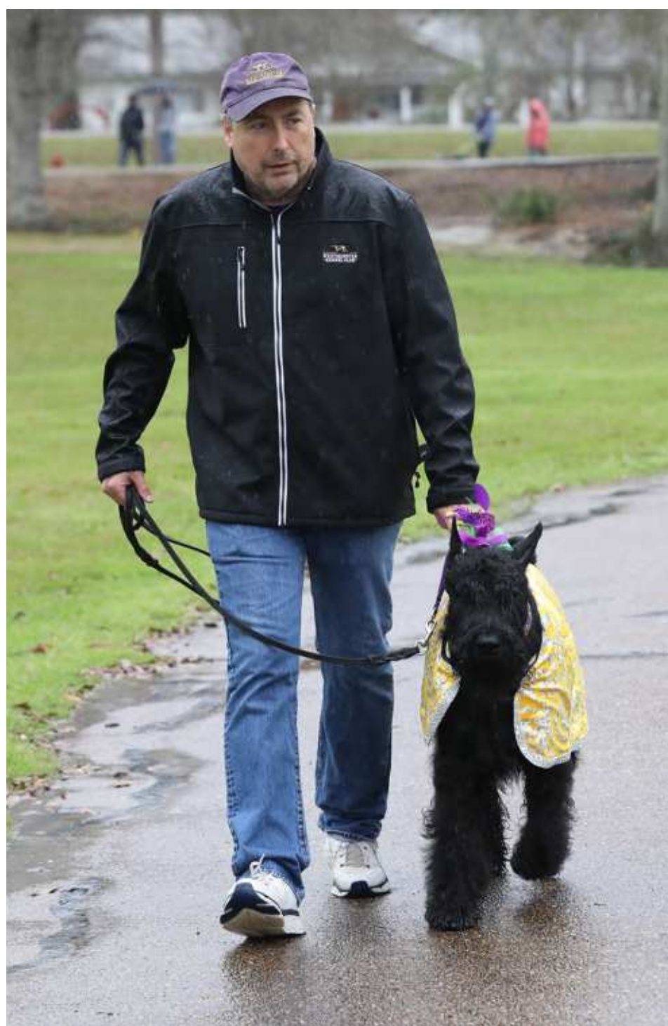
Pictured in the above, at right, and below photos are images from the City of Walker Parks and Recreation Department's second annual Mardi Gras-themed Bark in the Park and Kroux of Barkus Pet Parade on Saturday, Feb. 11, 2023. More photos from this event can be found on our website, www.livingstonparishnews.com.