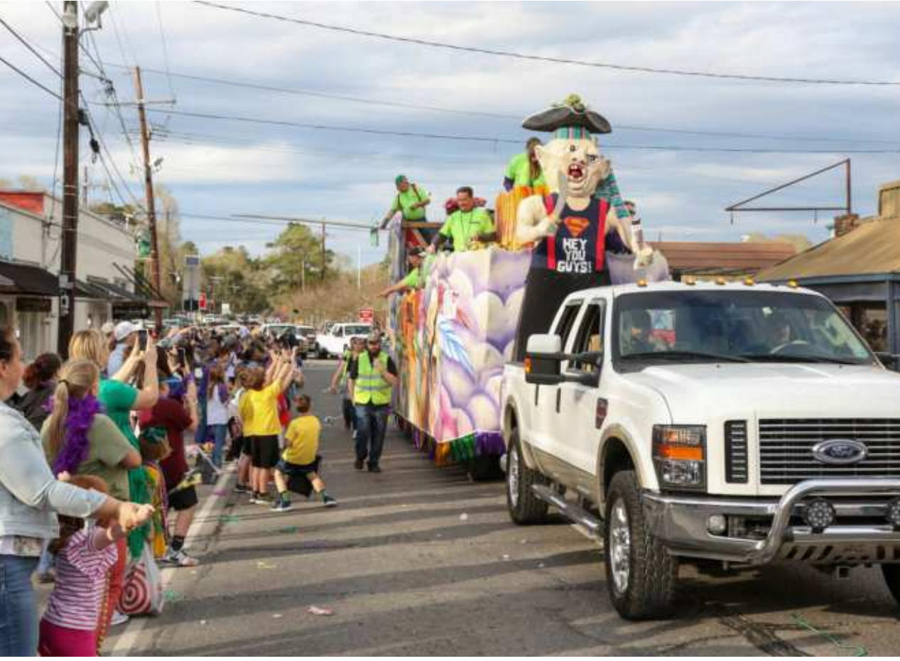
FILE PHOTO • THE NEWS