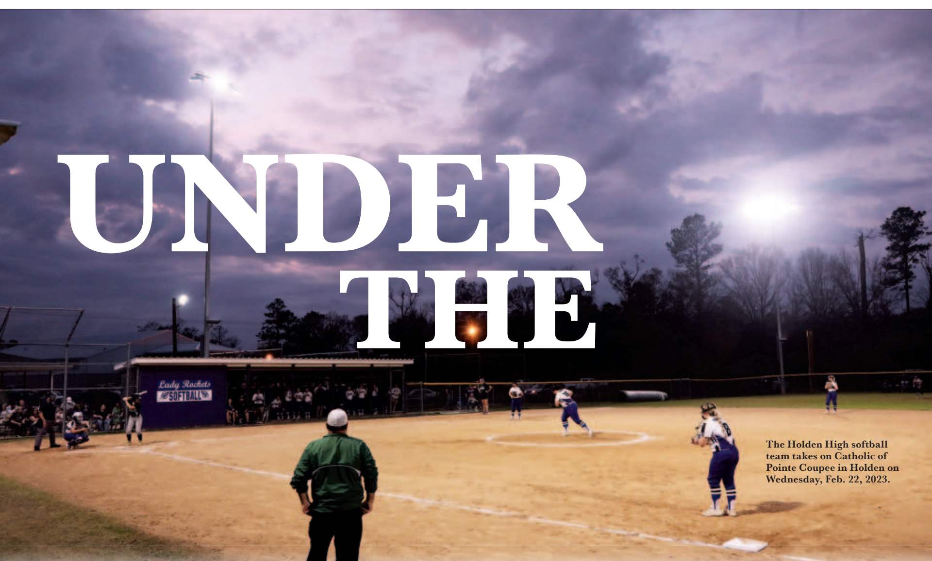
The Holden High softball team takes on Catholic of Pointe Coupee in Holden on Wednesday, Feb. 22, 2023.