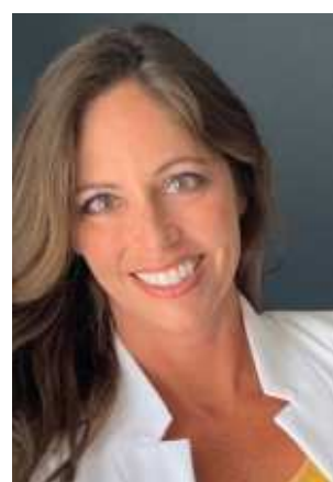
Edward Jones Financial Advisor.