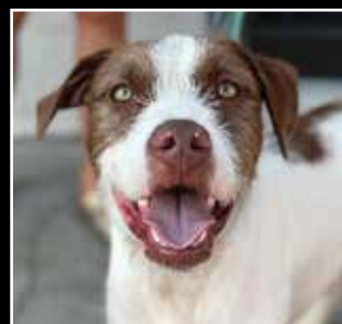
Cannoli - 8 Month Old Male Wheaten Terrier Mix