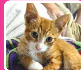
Stitch, 5 Month Old Male