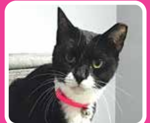
Mindy, 1 Year Old Female