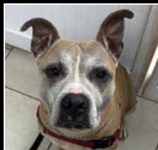
Miley - 7 Year Old Female Mixed Breed