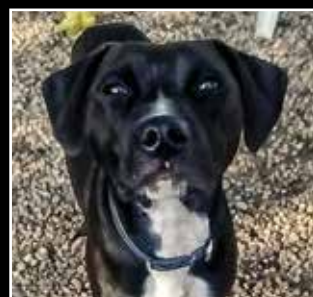
Pepper - 8 Month Old Female Lab Mix

631.593.1771 • 1430 Montauk Highway, Oakdale