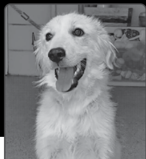
Gin 6 Month Old Male Pyrenees Mix