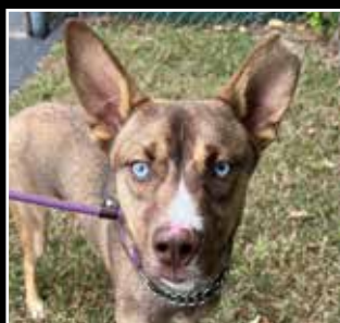
Chase - 1 Year Old Male Husky Mix

SUBSCRIBE TODAY! SEE PAGE 2 FOR DETAILS OR CALL 631-475-1000