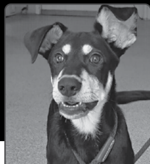
Bubbles 3 Month Old Female Terrier Mix