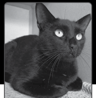
Glen 1 Year Old Male Black DSH Cat