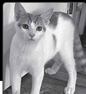
Jay 4 Month Old Male DSH Kitten