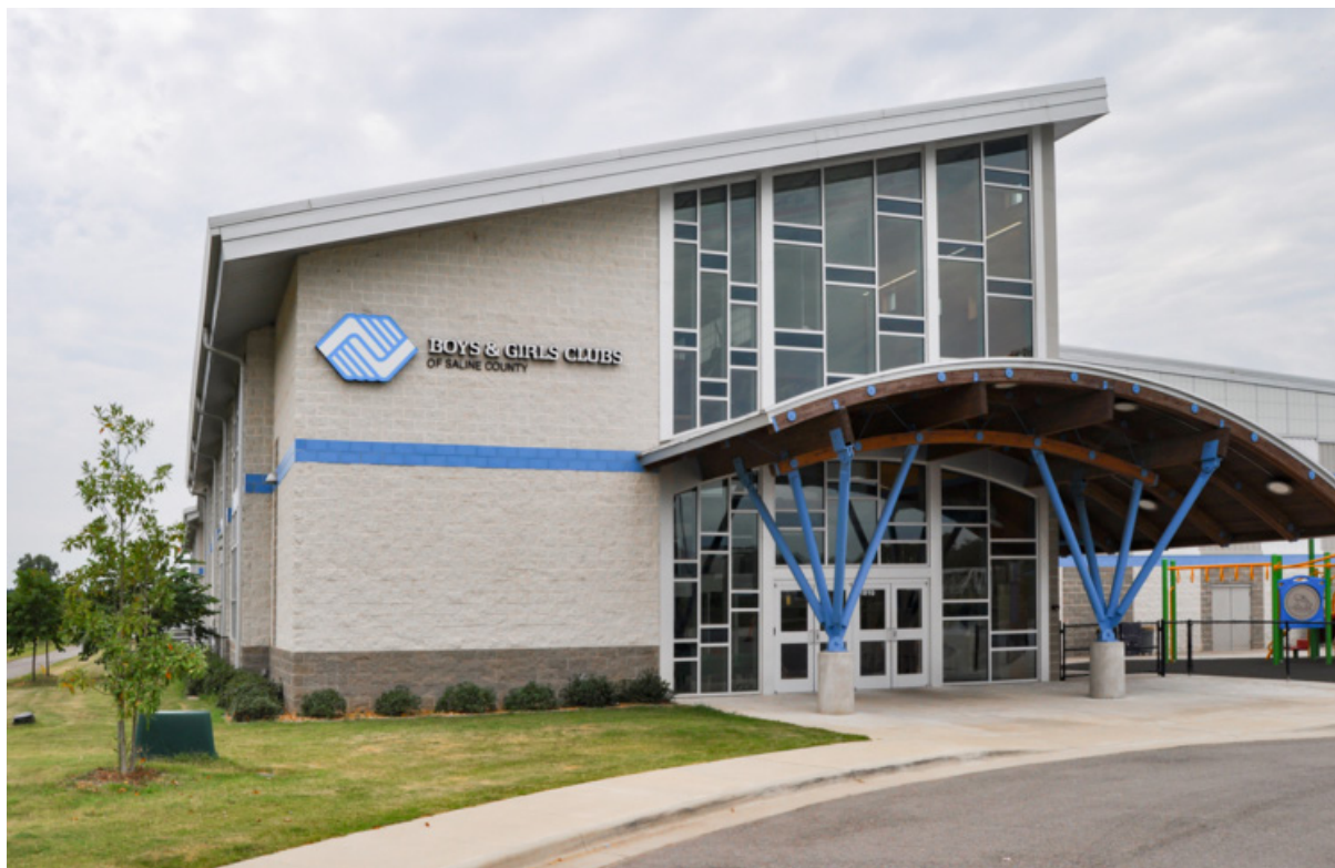
Boys and Girls Club of Saline County.