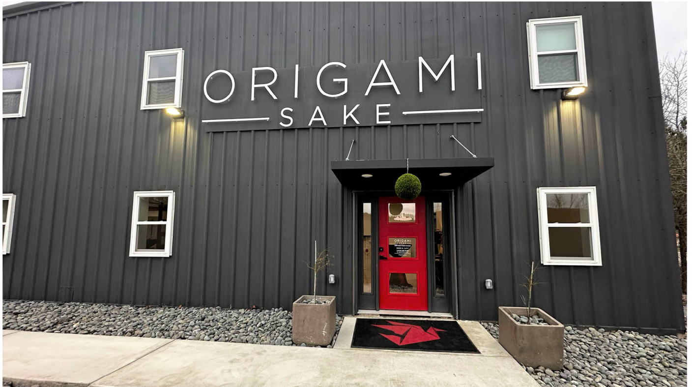
Origami Sake will open its doors in the spring and offer private tours by reservation.