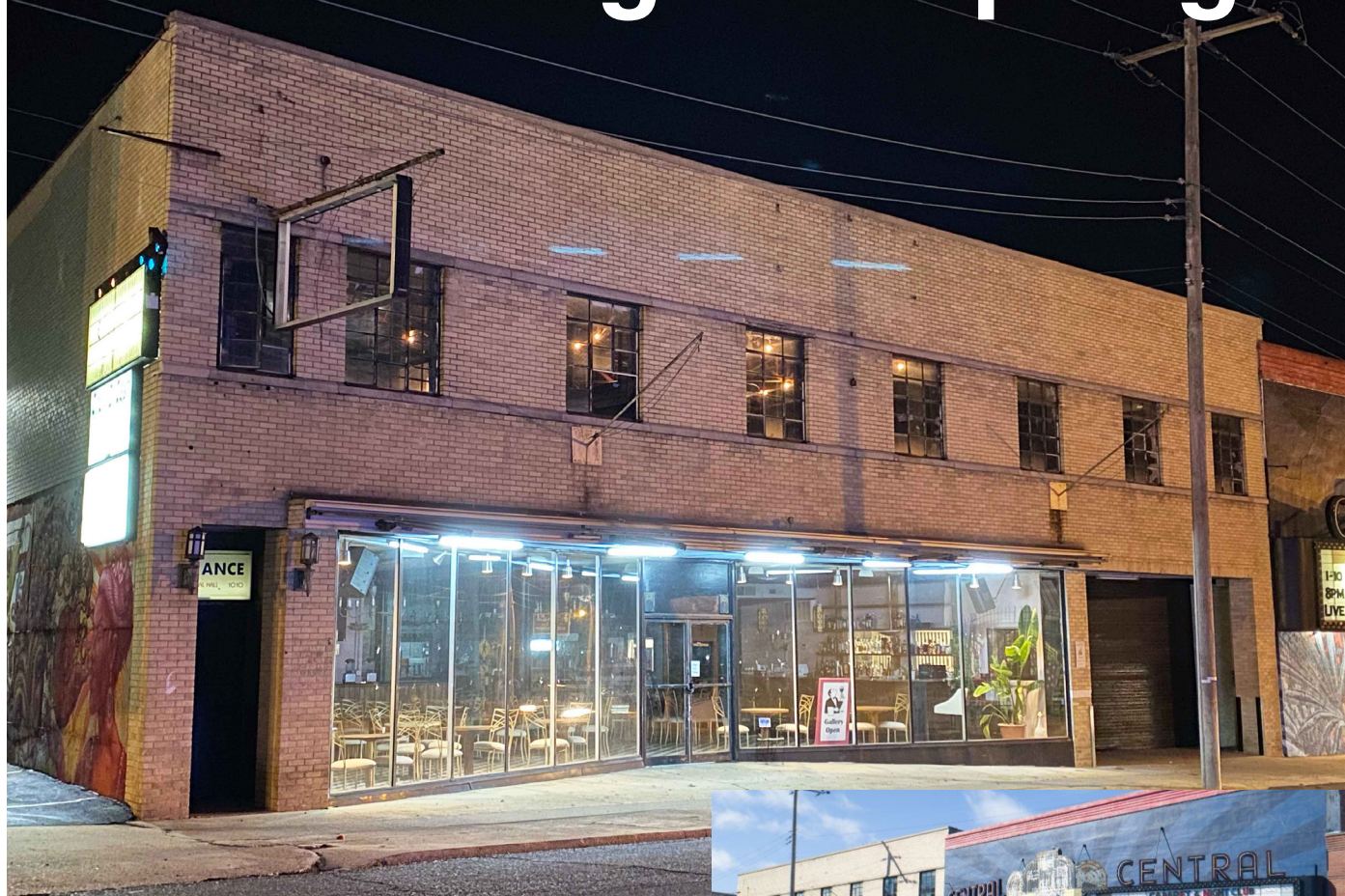
Hot Springs Central Theater, at right and Restaurant, above, after facelift.