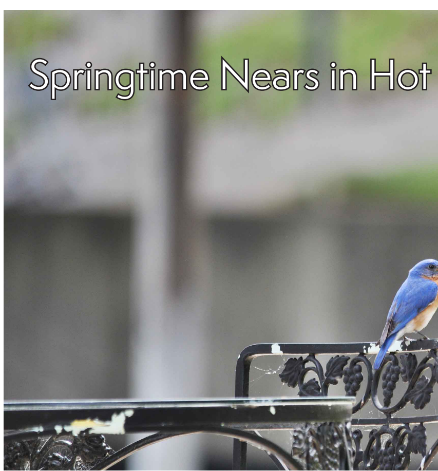
A bluebird perches on a chair.

Spring is upon us. St. Patrick's Day and daylight savings time arrive soon. In Hot Springs Village, the month of March can see snow, 70-degree temperatures and everything in between.