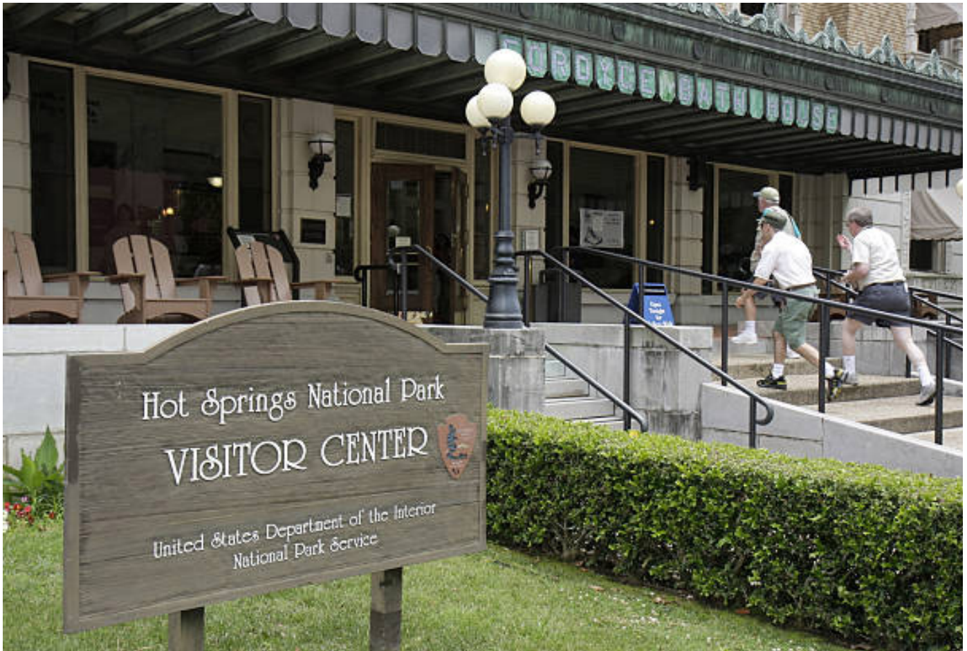
The Visitor Center at Hot Springs National Park is located in the Fordyce Bathhouse, which is currently closed for renovation.