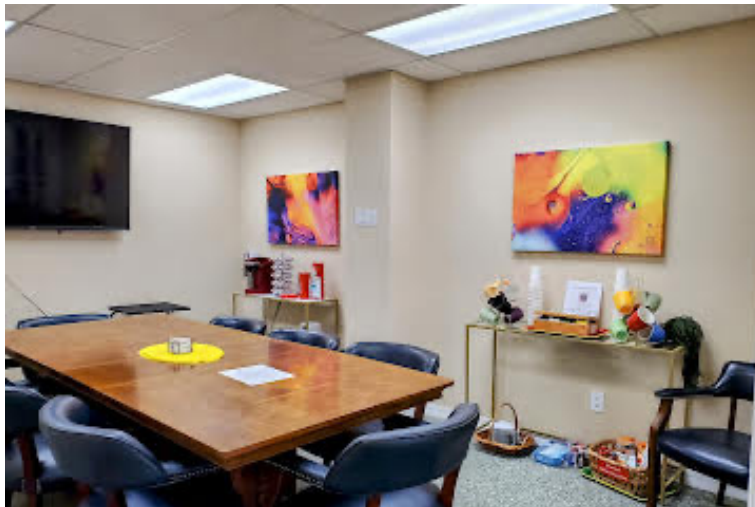
A comfortable and professional room to hold a meeting

Whether you are looking for a warm and inviting place to host a party, a professional and comfortable environment for a presentation, or an eye-popping, trendy spot for a pop-up, Shared Space can meet your needs. Sykora Shared Space can be rented hourly or daily from Sykora Investment Properties, LLC. Ample parking is available, and prices range from $25 an hour for a small conference or video room, to $35 an hour for a large conference room. For parties,