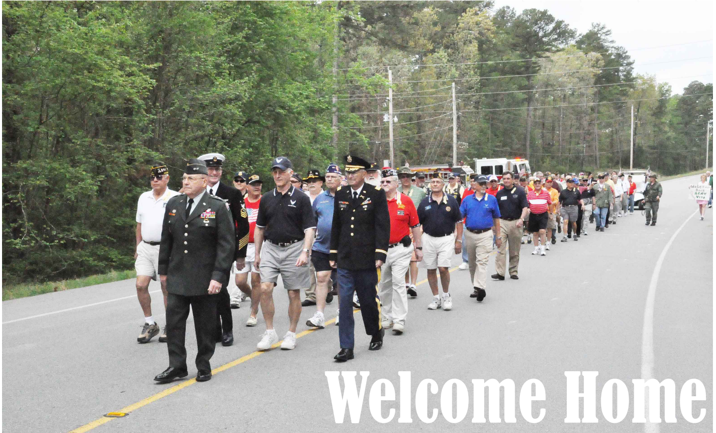
Vietnam Veterans march in the 2012 parade.