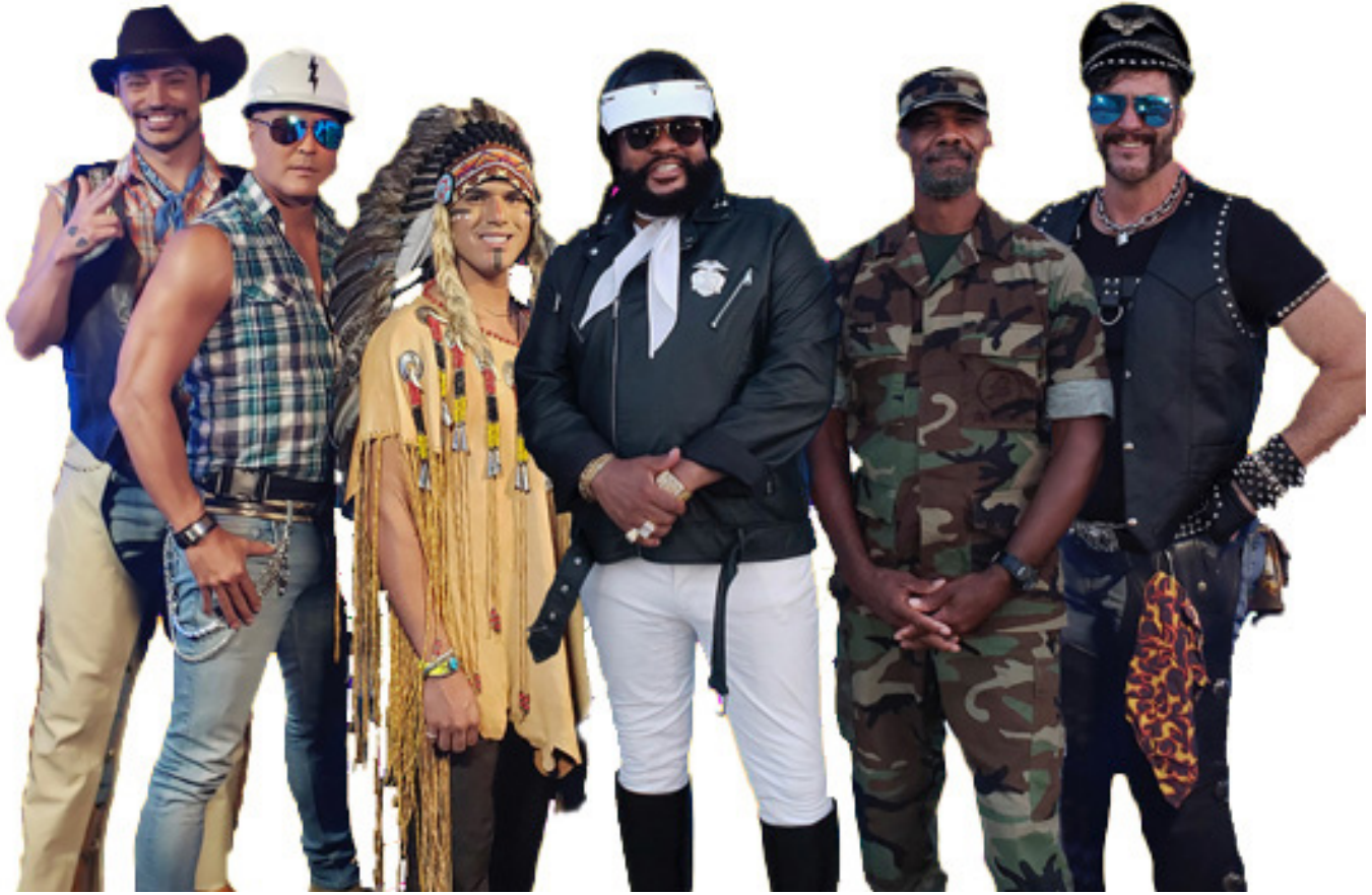
Get ready to sing "Y.M.C.A" along with The Village People.