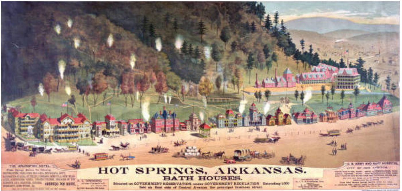
The Hot Springs Reservation, established by legislation in 1832, was the first unit in what is now the National Park Service.