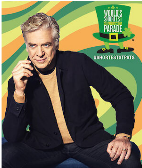
Christopher McDonald of "Happy Gilmore" fame is the official starter for the parade.