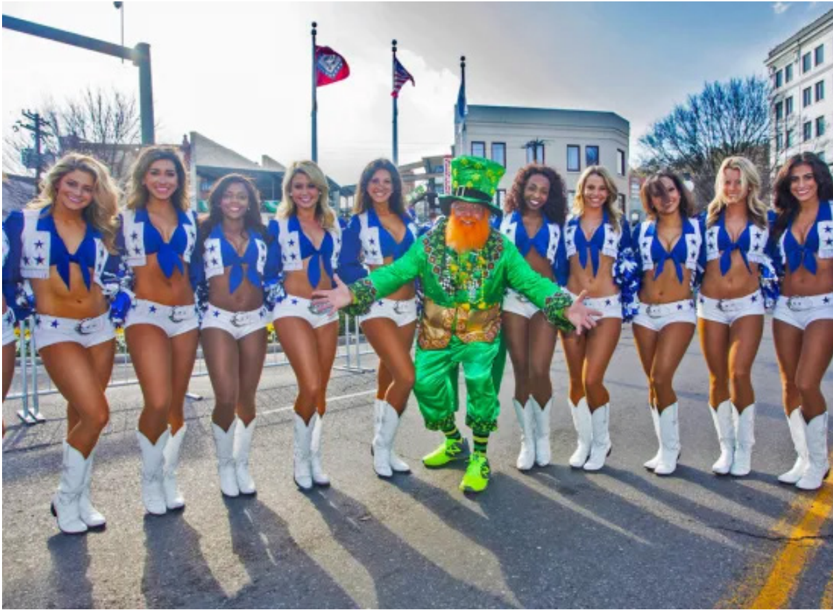
Dallas Cowboy Cheerleaders will return and are more than ready to celebrate.