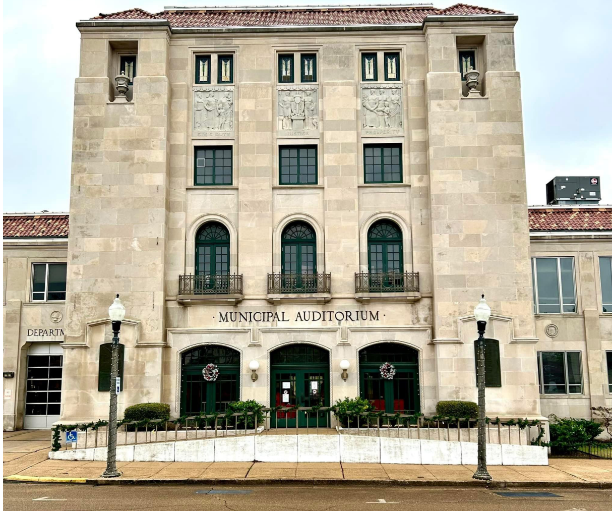
Arkansas Municipal Auditorium in Texarkana.