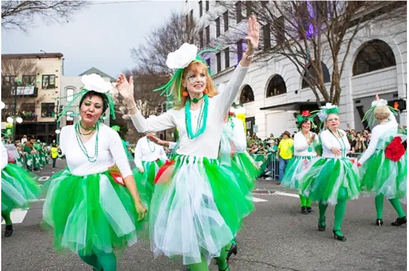
Spa City Tappers will be tapping their way down Bridge Street.

brought international attention to Hot Springs since its inception in 2003.