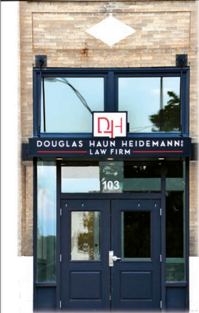
Originally the First National Bank Building at 103 E. Broadway in Bolivar, the location became the home of Douglas, Haun & Heidemann, P.C. in August of 2019.