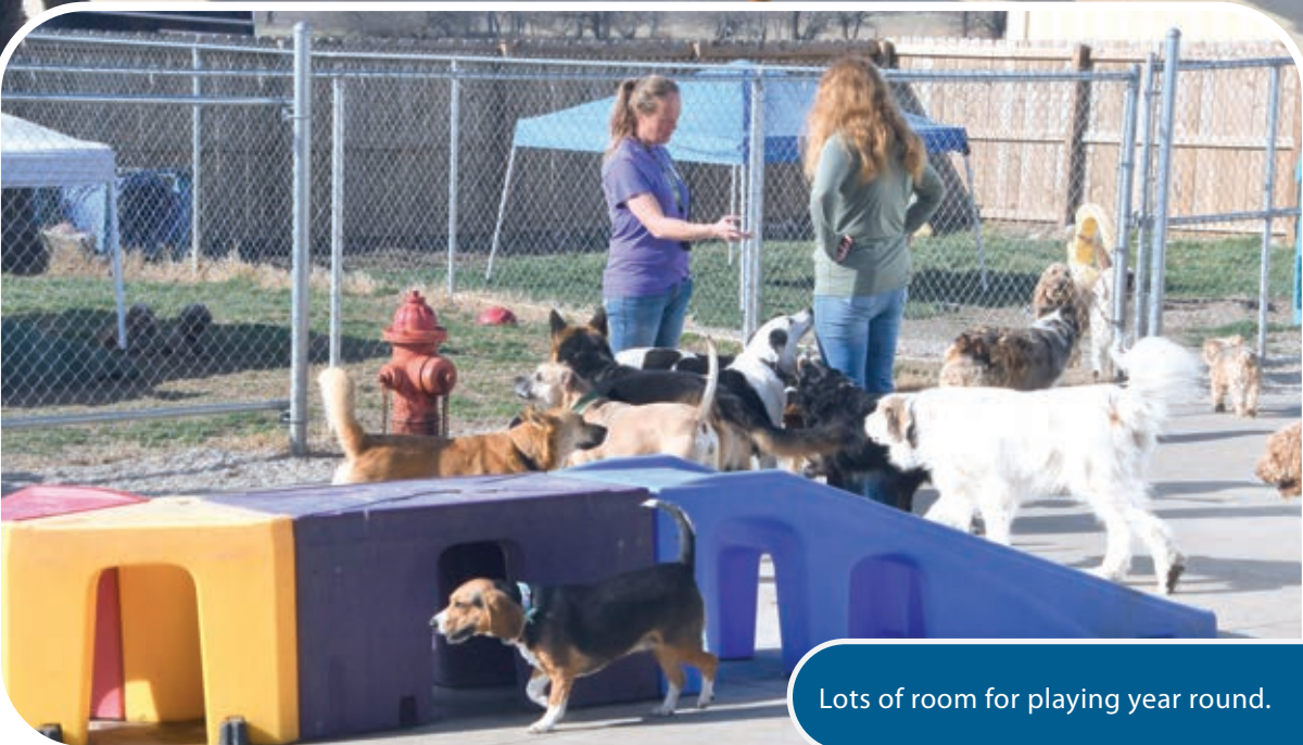
Lots of room for playing year round.