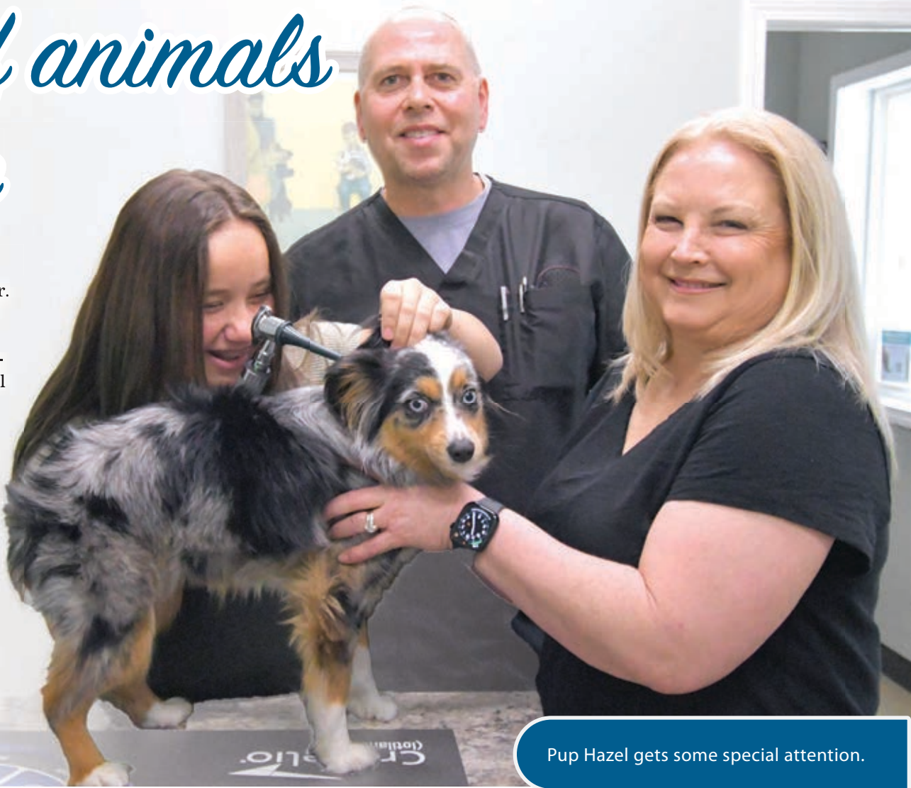
Pup Hazel gets some special attention.