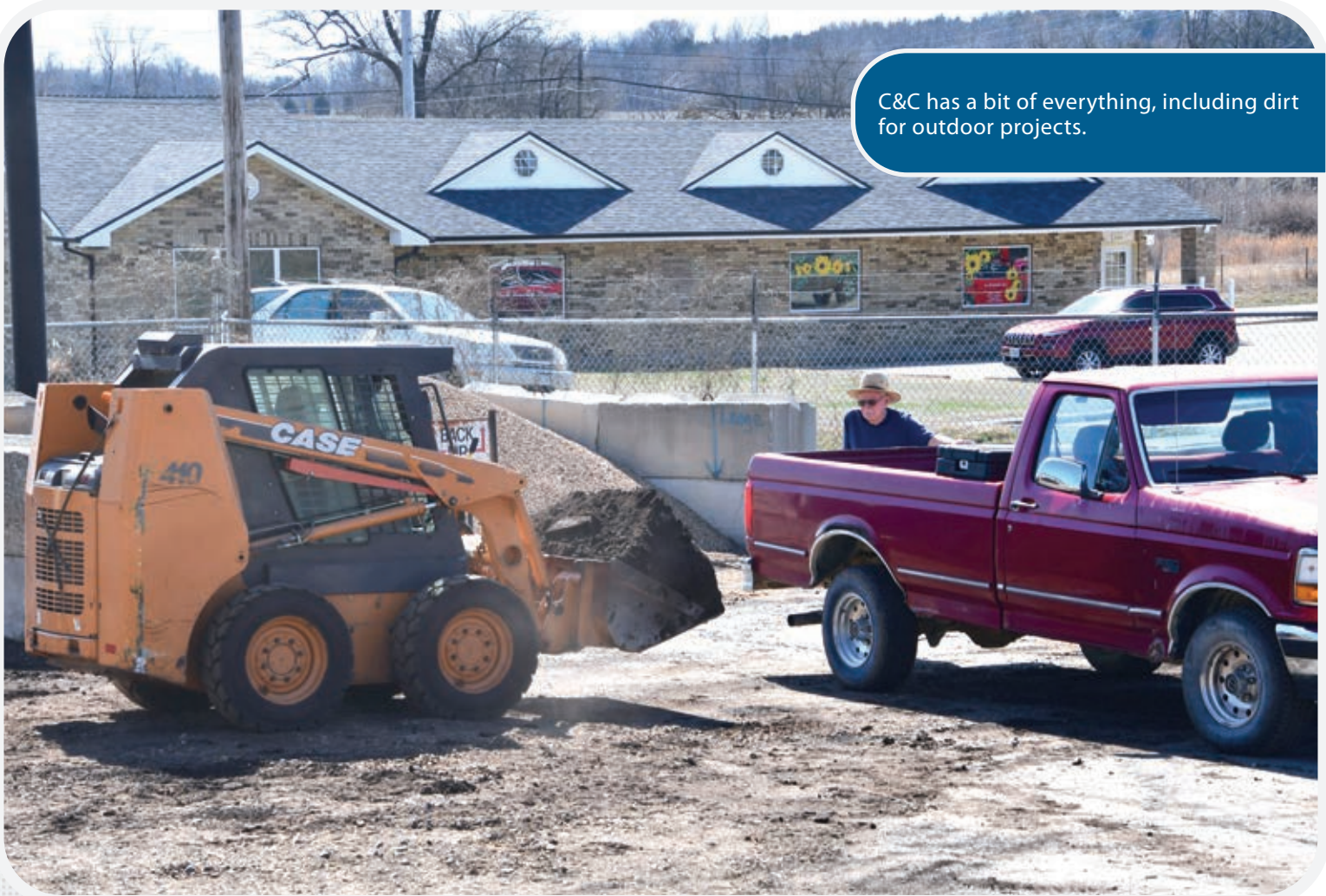
C&C has a bit of everything, including dirt for outdoor projects.