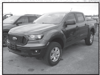
APR limited-term financing available on *20 Ranger on approved credit. Not all buyers will qualify. Offer expires 03/31/2021.