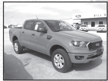
APR limited-term financing available on *20 Ranger on approved credit. Not all buyers will qualify. Offer expires 03/31/2021.