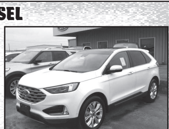
APR limited-term financing available on *20 Edge, on approved credit. Not all buyers will qualify. Offer expires 03/31/2021.