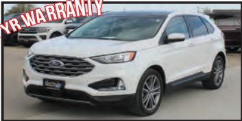
2020 Ford Edge Titanium $22,995