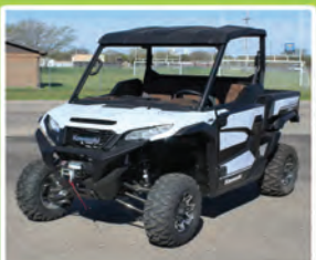
2024 Kawasaki Ridge Ranch Edition $21,879