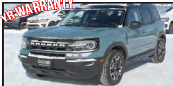
2021 Ford Bronco Sport Outer Banks $27,995