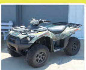
2023 Kawasaki Brute Force® 750 4X4i EPS CAMO $8,995