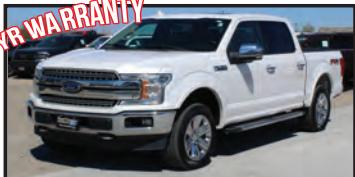
2018 Ford F-150 Lariat $29,995