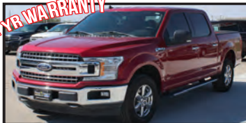
2020 Ford F-150 XLT $29,995