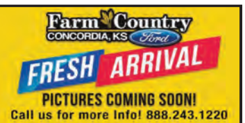
2017 Ford F-250 Super Duty Lariat Diesel! $43,995