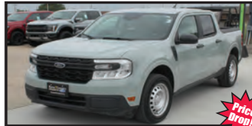
2022 Ford Maverick XL $22,995 $21,995