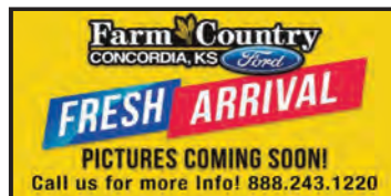
2015 Chevrolet Colorado Z71 $17,995