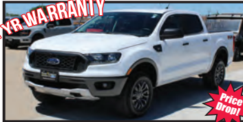
2020 Ford Ranger XLT $29,995 $28,995