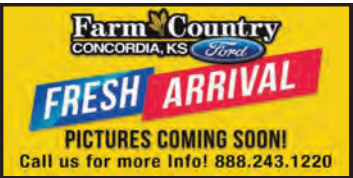
2019 Lincoln Navigator L Select 1 Year Warranty! $33,995