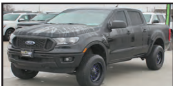
2022 Ford Ranger STX $32,995