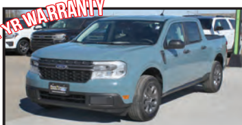
2022 Ford Maverick XLT $24,995

FARM FRESH ARRIVALS CALL US FOR PICTURES