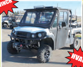
2020 Kawasaki Mule PRO-FX $19,995 $18,995