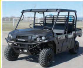
2024 Kawasaki Mule PRO-FXT 1000 $19,679