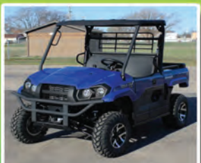
2024 Kawasaki Mule PRO-MX (EPS) LE $14,649