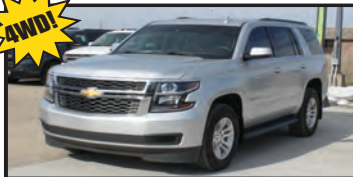
2017 Chevrolet Tahoe LT $23,995 $22,995