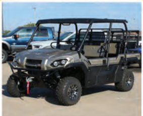
2024 Kawasaki Mule PRO-FXT 1000 LE Ranch Edition $22,324