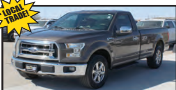
2016 Ford F-150 XLT $14,995

FARM FRESH ARRIVALS CALL US FOR PICTURES