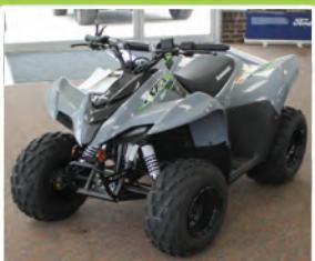
2025 Kawasaki KFX 90 $2,999