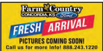
2013 Ford F-150 XLT $13,995