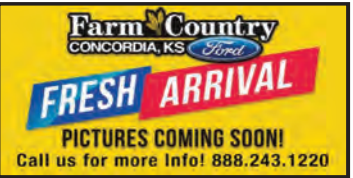
2017 Lincoln MKC Reserve $16,995