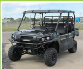
2024 Kawasaki Mule PRO-FXT 1000 LE $19,724