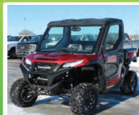
2024 Kawasaki Ridge 2500 HVAC $26,999