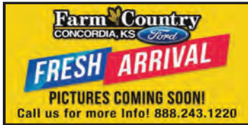
2013 Ford Explorer Limited $11,995