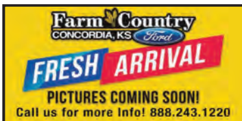
2020 Lincoln Aviator Reserve 1 Year Warranty! $28,995