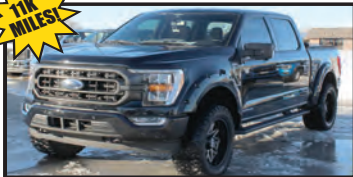
2023 Ford F-150 XLT $48,995 $47,995