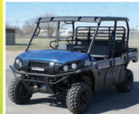
2024 Kawasaki Mule PRO-FXT 1000 $19,679