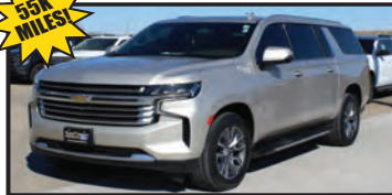
2023 Chevrolet Suburban High Country $60,995