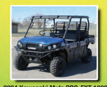
2024 Kawasaki Mule PRO-FXT 1000 $19,679