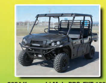
2024 Kawasaki Mule PRO-FXT 1000 $19,679