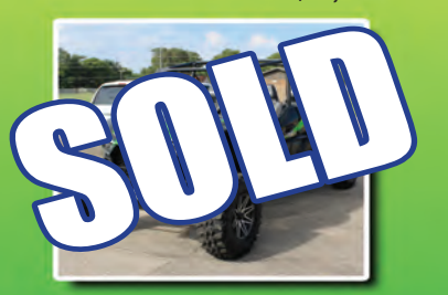
2024 Kawasaki Teryx KRX4 1000 eS $23,699