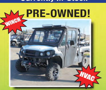
2020 Kawasaki Mule PRO-FX