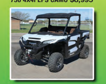
2024 Kawasaki Ridge Ranch Edition $21,879